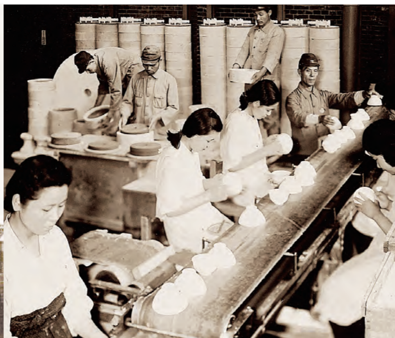
Firing plant for mixed-firing of tableware and grinding wheels (around 1940)