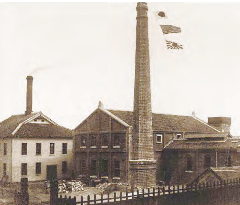
The Headquarters Plant at the company's founding (1904)