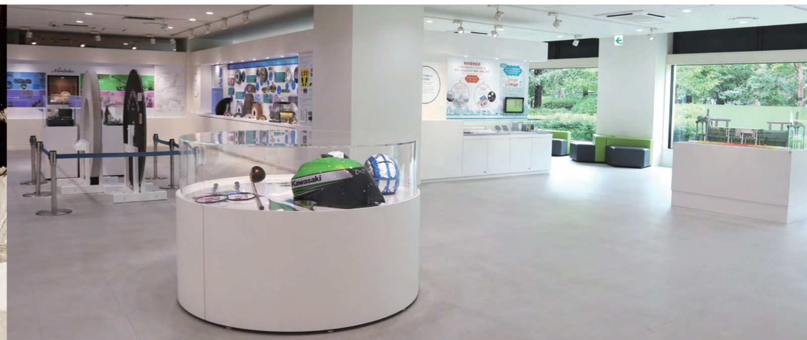
Welcome Center (technology corner)