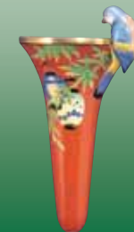
Vase :Porcelain H.8.3in. 1918 ~ 1930